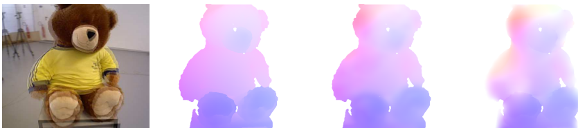
Fig. 2. Camera motion. From left to the right: a) Input images. b) Optical flow of the rigid motion estimation. c) Optical flow using the proposed method. d) Optical flow by the scene flow method [13]. Results of the proposed method are clearly more accurate than those of [13].

this scene presents a changing 3D motion field due to the translation and rotation of the sensor. We first estimate a single rigid motion as is presented in Sec. 4.4. We estimate the parameters using every second pixel with a range between 50 cm and 150 cm from the sensor. At each level of the pyramid we run 100 iterations. This result is taken as baseline and compared in Figure 2 with resulting optical flows of our method and the dense estimation provided by [13]. The proposed method produces a close estimation of the camera motion without assuming a global rigidity of the scene. In contrast, the direct regularization on the scene flow components, as is performed in [13], fails to capture the diversity of 3D motions introduced by the camera rotation.